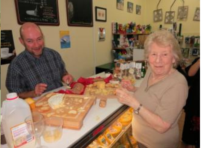
Some photos from the Cheese Night at the ABC Cheese Factory – Central Tilba