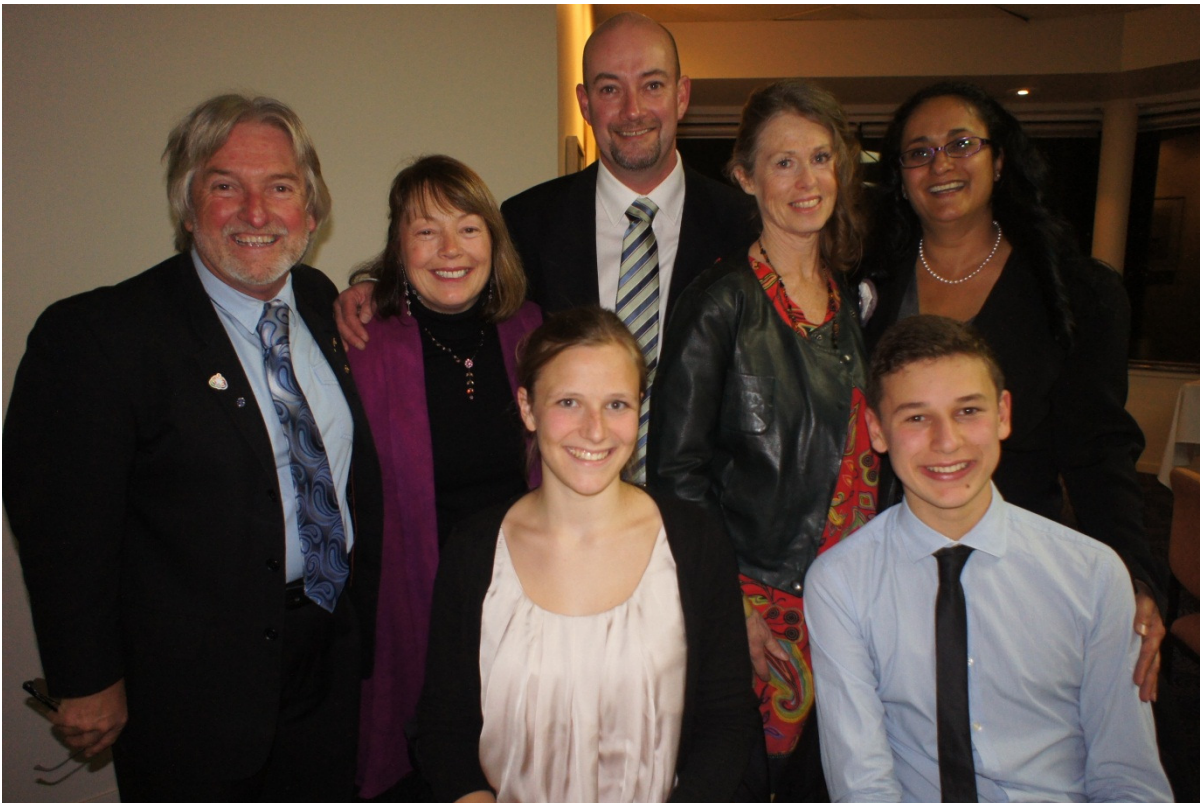
Some more photos from the Changeover