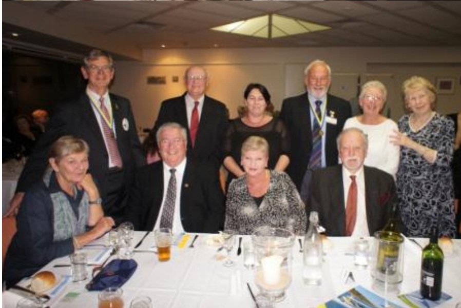
Some pictures from last week's Changeover – Thanks to Bob Antill