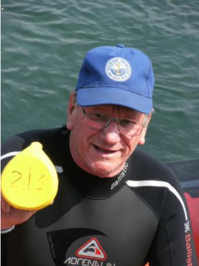
Below It's all over for another year. The ducks are collected.