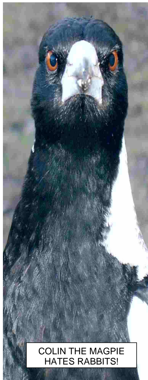
COLIN THE MAGPIE HATES RABBITS!