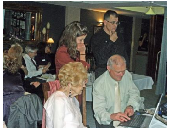
Below How many hands to fix a data projector?